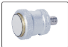
straight-beam probe (included)