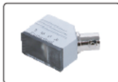
angle-beam probe (included)