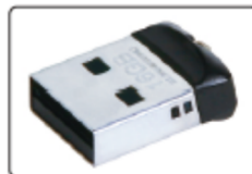
USB disk (included)