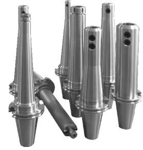
Long Lengths (12" in Stock)