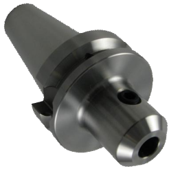
BT30, BT40, BT50